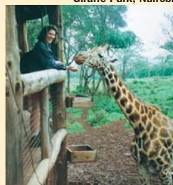
Giraffe Park, Nairobi