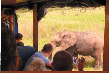
View from the truck, Queen Elizabeth National Park