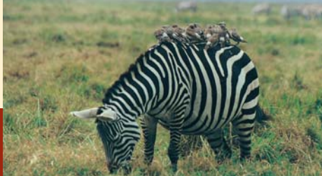
Zebra with oxpeckers