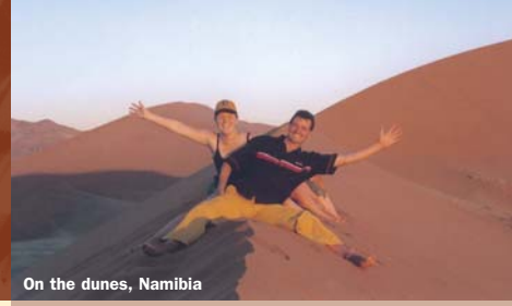
On the dunes, Namibia