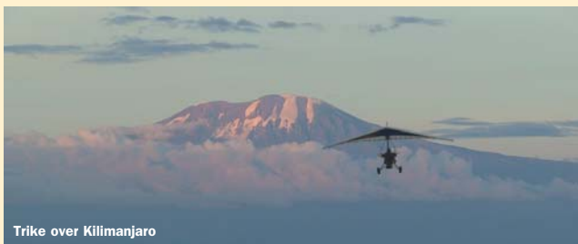
Trike over Kilimanjaro