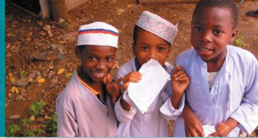
Kids on Zanzibar Island