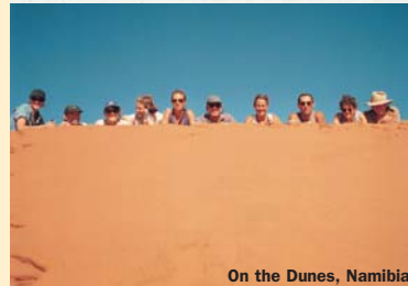
On the Dunes, Namibia