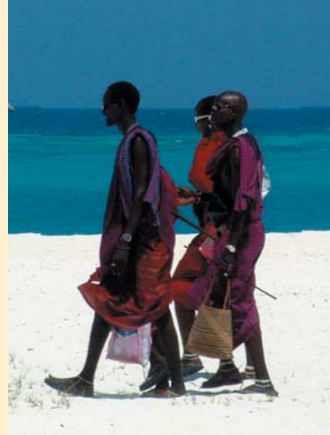
Maasai, Kendwa Beach, Zanzibar

As well as two experienced English speaking crew, specialist local guides en route, transport in a custom-built overland truck including all camping and cooking gear - fridge, gas cooker, tents, sleep mats etc. Advice and back up from the Absolute team. Road tolls and taxes paid