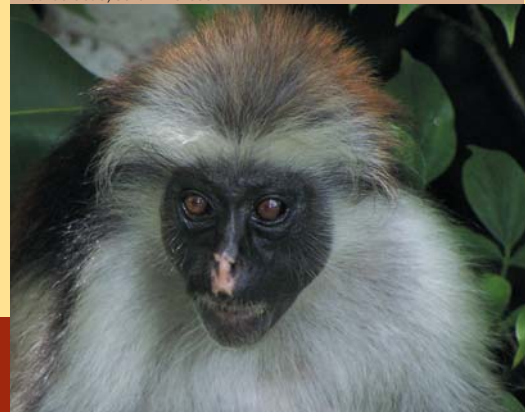
Red colobus, Jozani Forest