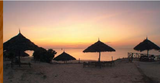
Sunset Bungalows, Zanzibar