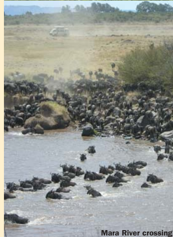
Mara River crossing