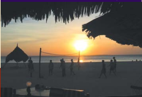
Kendwa Beach, Zanzibar