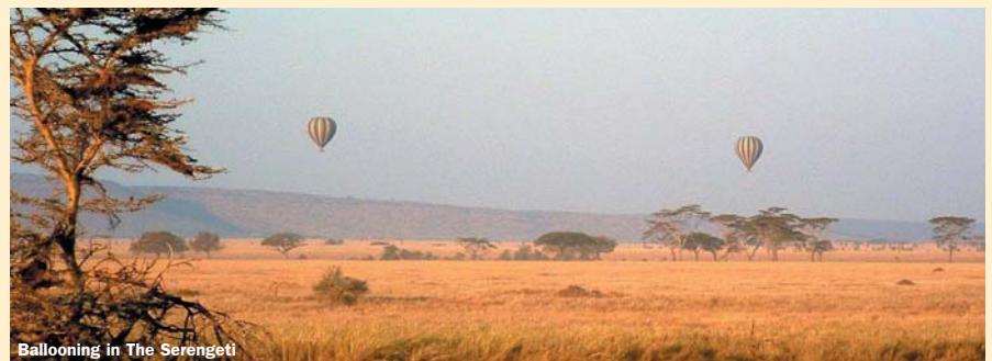
Ballooning in The Serengeti