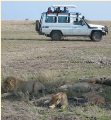
Game drives, Ngorongoro Crater

Visiting: Rwanda, Tanzania and Zanzibar Island