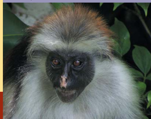
Red colobus, Jozani Forest

Special departure details • 23 Dec 09 and 23 Dec 10 - Christmas at the Gorilla Parks • 17 Dec 10, 17 day itinerary, Christmas on leaving the game parks New Years on Zanzibar