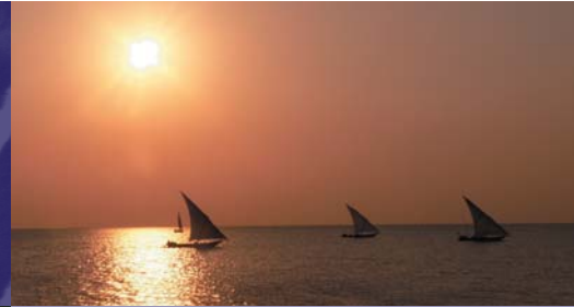
Dhows at sunset, Zanzibar